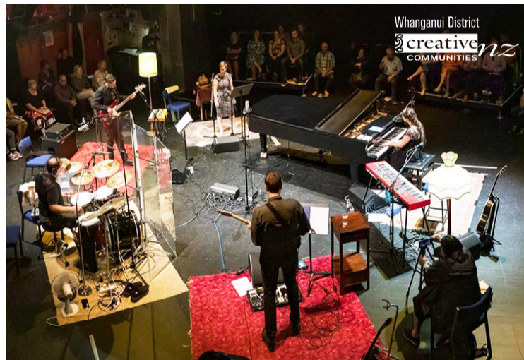
Flow Collective perform at an album-recording session with Creative Communities support

To find out more, please visit Whanganui District Council’s website at: buff.ly/4d8x4zd